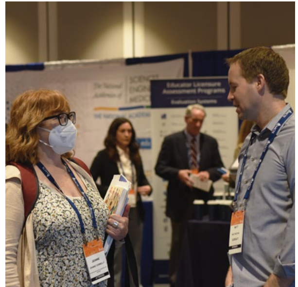
Exhibit Sales and Show Management

The official AACTE representative for exhibit sales and show management is: